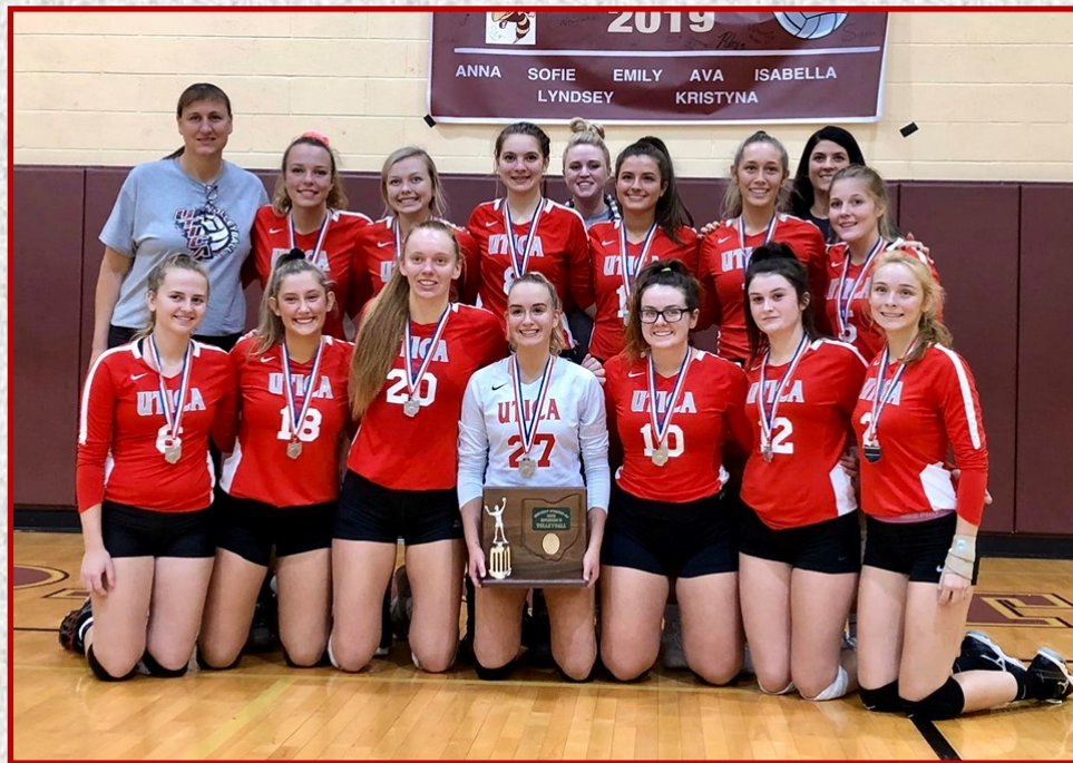
Congratulations Utica Volleyball Team! LCL Cardinal Division Co-Champions District Runner-Up